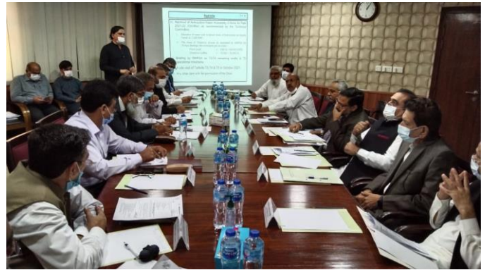
Chairman & Members IRSA attending IAC meeting